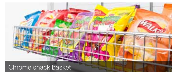
Chrome snack basket